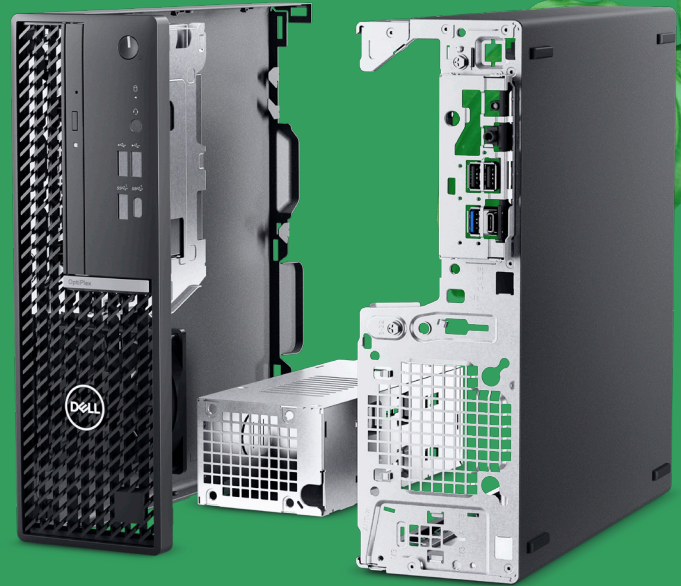
A look inside: Post-industrial recycled steel

OptiPlex is passionate about reducing our products' carbon footprint and helping our customers make an impact on the future. Committed to circular design throughout the lifecycle, we're driving the innovative use of materials, packaging, energy conservation, recycling and even reparability.