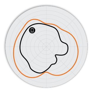
Figure 2. R350 2.4GHz Azimuth Antenna Patterns