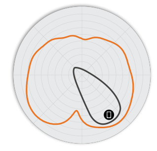
Figure 4. R350 2.4GHz Elevation Antenna Patterns