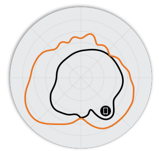
Figure 3. R350 5GHz AzimuthAntenna Patterns