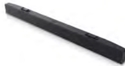
Dell Slim Soundbar - SB521A

Stay focused on a 27-inch QHD monitor optimized to deliver high performance details and clarity.