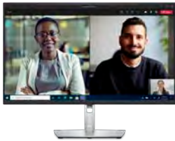
Dell 27 Monitor - P2723D

Create your ideal workspace with these recommended accessories.